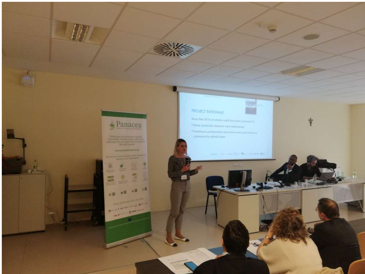
FIGURE 2: SecureHospitalals.eu presentation at the PANACEA Workshop

Additional cooperation activities in the form of workshops, trainings, and dissemination events were, and mutual sharing of outcomes were also discussed and planned among all represented projects.